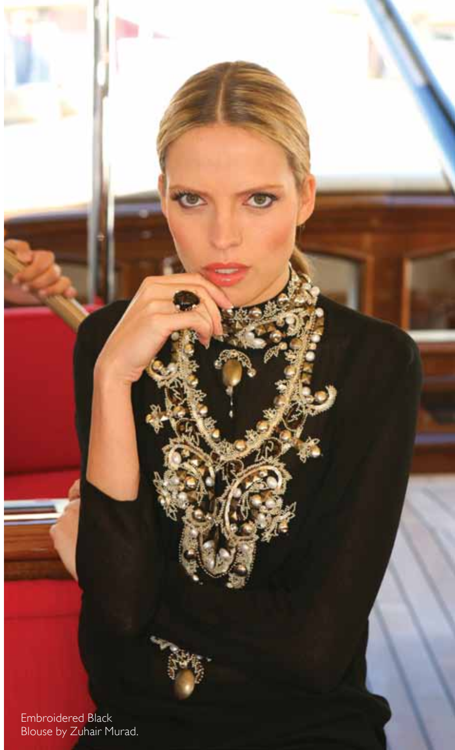
Embroidered Black Blouse by Zuhair Murad.